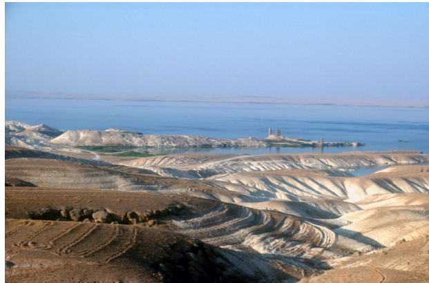
View from the Umayyad palace to Emar and Balis.

Since 1996, the Universities of Tübingen and Princeton, in cooperation with the Syrian Directorate General of Antiquities and Museums, have undertaken successful excavations in Emar, an important Bronze Age town, and in the town of Barbalissos – Balis, which succeeded Emar. An Umayyad palace and a Shiite sanctuary dating to the 11th century were exposed in the immediate vicinity so that, on an area of less than two square kilometres, a unique panorama of Syrian history is now displayed.