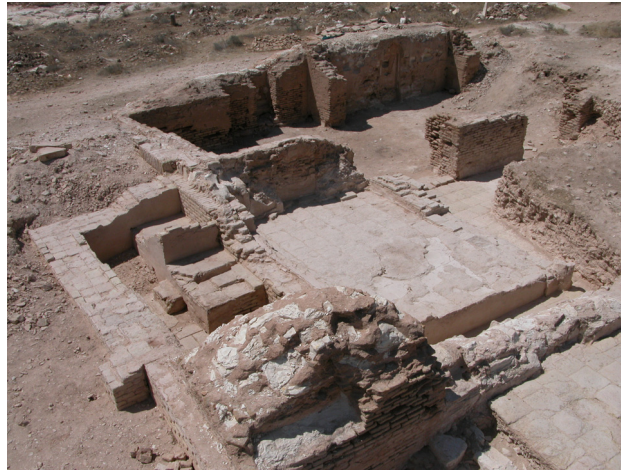
Mashhad. Excavations until 2007.

Mashhad: Back at the banks of the Lake we visit the important Shiite sanctuary dating to the 11th century, that has recently been excavated.