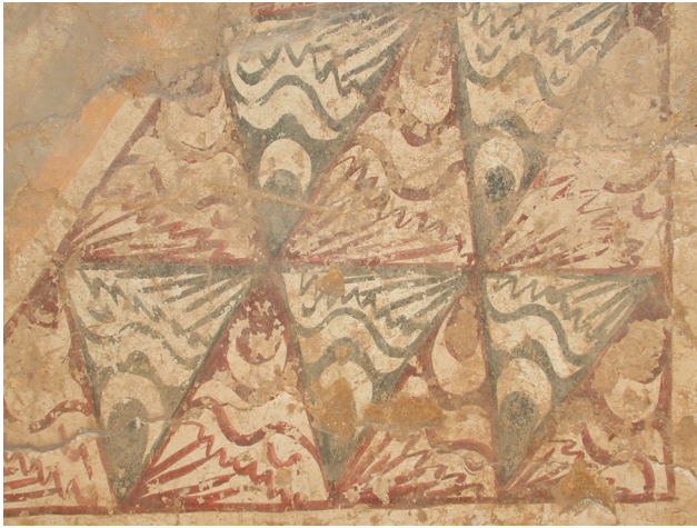
Qasr. Wall paintings in the audience hall (partial view)

Qasr: With its beautiful wall paintings, the palace above the Lake takes us to the glorious epoch of the Umayyad caliphs at the beginning of the 8th century.