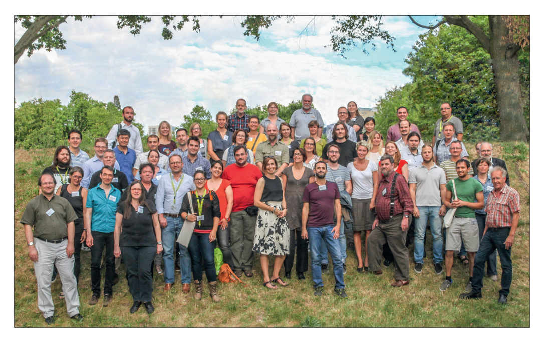
Fig. 2: Participants of the International ROCEEH Conference on Human Expansions in Frankfurt am Main, Germany.

After two symposia focusing on environmental perspectives ('Human Expansions and Global Change in the Pleistocene – Problems and Methods' in Frankfurt am Main 2009) and cultural aspects of human expansion ('The Nature of Culture' in Tübingen 2011, see Haidle and Conard 2011), ROCEEH organized an international conference in 2015 (13-17 July) at the Senckenberg Biodiversity and Climate Research Center in Frankfurt am Main, Germany, to take a closer interdisciplinary look at expansions from the perspectives of ecospace, cultural performances/capacities, and range according to different methodological and geographical approaches. The goal of the meeting was to enable exchange and discussion of new research results among more than 70 participants from the fields of anthropology, archaeology, geography, computer science, mathematics, ornithology, palaeoecology, palaeontology, zooarchaeology, and the geosciences (Fig. 2). The research results were presented in 45 lectures in five sessions and 13 posters.