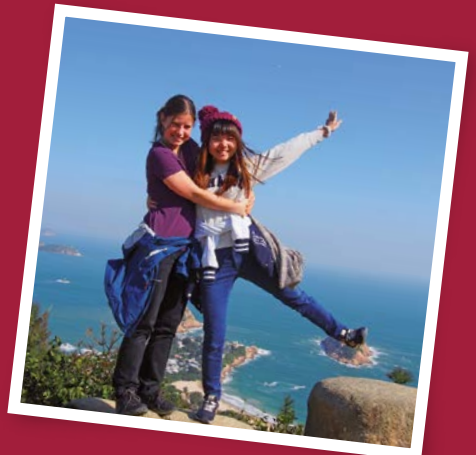
... and a few months later during a visit to Hong Kong