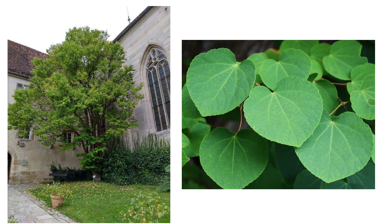
The Katsura or caramel tree ( Cercidiphyllum japonicum) at Bebenhausen outside Tübingen.