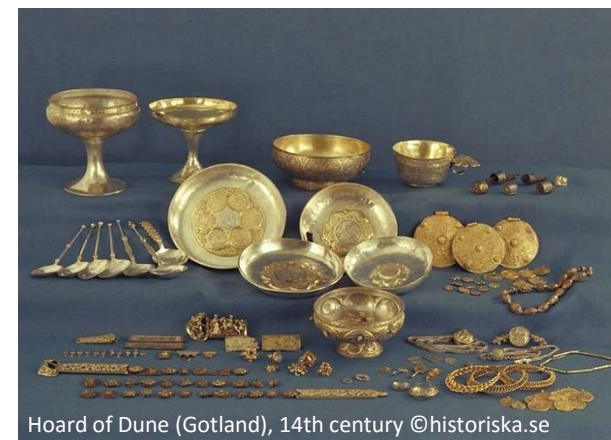
Hoard of Dune (Gotland), 14th century

Project C 05: Profit and dissipation of resources. Creation of ideological capital in the Viking Age and the Late Middle Age in Northern Europe