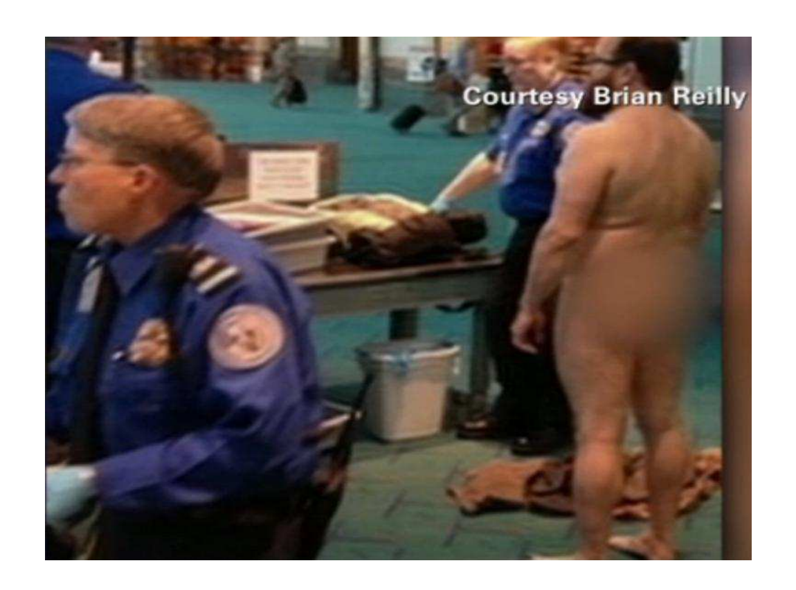
@ Portland International Airport, April 18, 2012