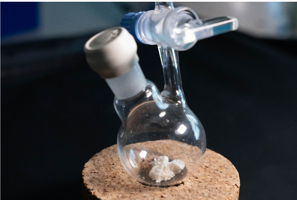
The active substance epifadin in its isolated pure form. The unstable active substance has to be stored under shielding gas.