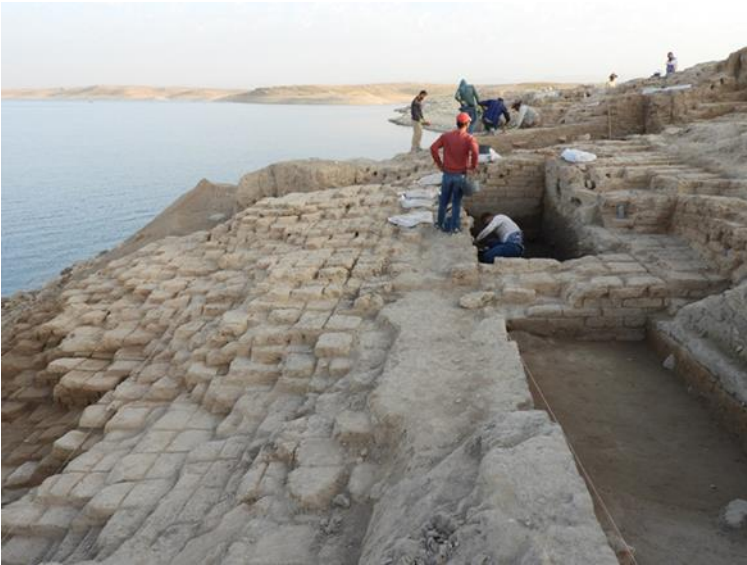
Terrace wall at Kemune Palace