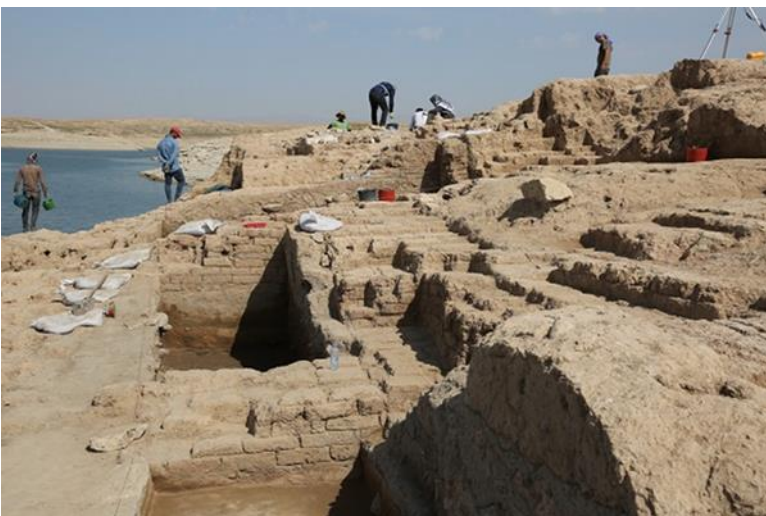
Kemune Palace from the south.