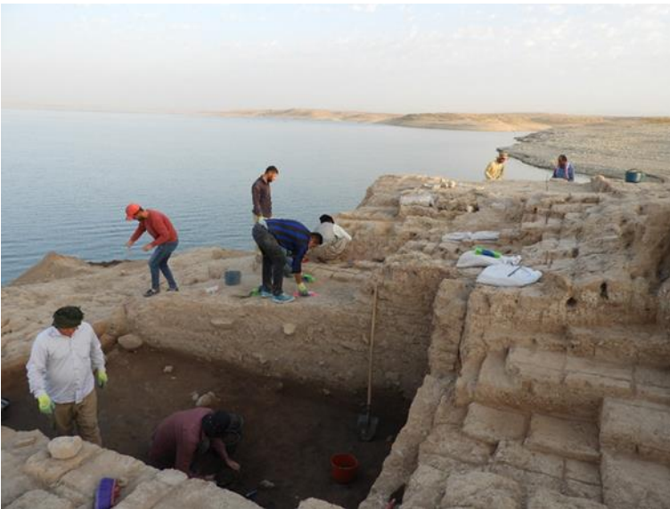
A room in the palace during excavations