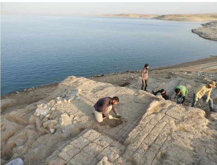
The excavations on the shore of Mosul Dam; a room in Kemune Palace in which murals were found