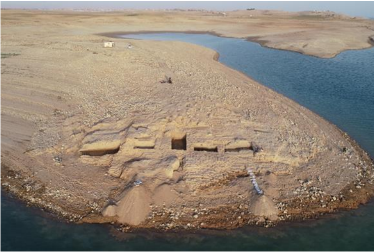
Aerial view of Kemune Palace from the west.