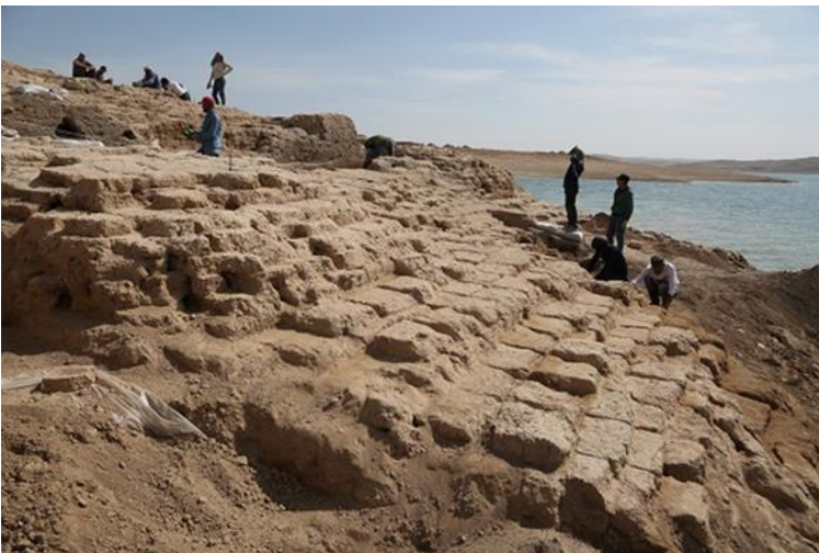
Terrace wall on the western side of Kemune Palace